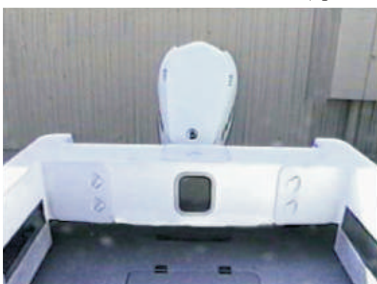
Below: Lift out Dive Door. and black slab side gelcoat hull.